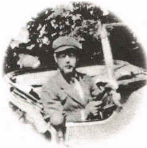
Bonnard at the wheel of his first car in 1912

Bonnard is French to his core. His theme is the beauty of human beings, Nature, and the home. He is a kindred spirit to Renoir. But this is to do both a gross injustice and say nothing of what it is that makes each unique.